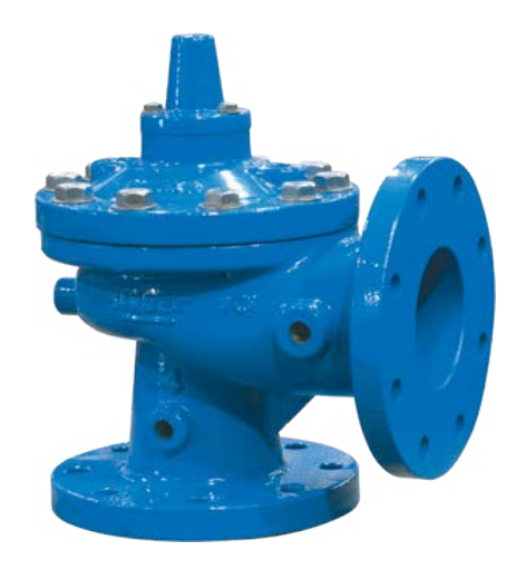
FIG. 1 Alternative models A206-PG Angle